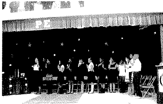
2011-2012 Jr. Beta Club Induction Ceremony