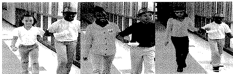
Perkerson rolls out the red carpet in honor of our Students of the Month. Pictured are students entering the bi-monthly celebration, which features a hot breakfast for students and their families.