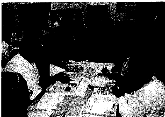
Teachers gain valuable content and pedagogical knowledge to continuously increase their effectiveness in the classroom. Our goal is a world-class education for all children.

Teachers are engaged in on-going research-based professional learning that focuses on integrating literacy in the content areas. Teachers are trained on best research-based instructional practices aligned to specific learning goals and the highest levels of Bloom's Taxonomy that lead to high student achievement.