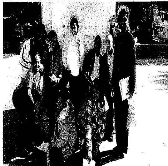
Last fall, students in the gifted program visited the Federal Reserve Bank of Atlanta to learn about the monetary institution's role in promoting development and supporting access to financial services.